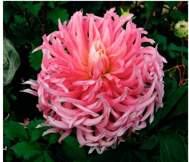
Photo of Hollyhill Cotton Candy