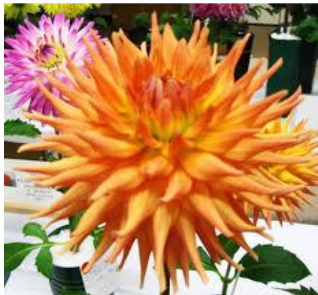
Scott's Caldera, B SC Bronze

Leaf cuttings can help you propagate large numbers of plants but as you can see the process is more complicated than taking tuber cuttings. Success rates for rooting leaf cuttings can be very high, easily over 90%. That is very comparable to tuber cuttings. It is the extra growing time that the plants need to mature that is the biggest negative in the process.