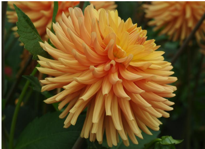
Hollyhill Showtime, B SC Orange New for 2017

And finally let's discuss the actual process of taking the cuttings. As explained above, you need a dahlia plant that has been grown to 12 - 18 inches tall. That plant can either be a tuber that was allowed to grow tall or a rooted tuber cutting that has been grown to that height. I use tuber cuttings to produce my plants.