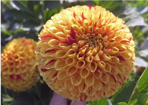
Hollyhill Spreckles, MB Variegated

cubes, sterile sand and others. I use sterile potting mix called germination mix. It is a peat moss based product that has some vermiculite or perlite, a bit of lime to raise the pH, and a surfactant to allow the mix to absorb water quickly. Note that it has no fertilizer in it and fertilizer is not recommended for use in rooting dahlias.