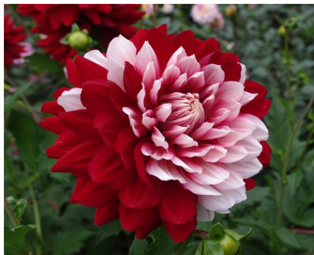
Hollyhill Court Jester

Our annual board meeting will take place Saturday, January 19th, 2019. We will meet at Multnomah Learning Academy Charter School located at 22565 NE Halsey St., Fairview, OR 97024. We will start the meeting with a potluck luncheon at noon with the board meeting following at 12:30. Those on the show committee and/or trial garden committee will begin their session at 10:00 AM. Everyone is encouraged to bring a dish they believe others will find popular. All members are welcome at this meeting. You need not be a member of the board to participate. We will be discussing what went well and where and how we can improve. What do we want to change or revise in the show schedule to make it even better? How can we increase participation in our annual show? What changes would you like to see in our monthly meeting programs? How can we go about attracting and retaining more new members? This is a planning and strategizing session, so please bring your ideas and enthusiasm.