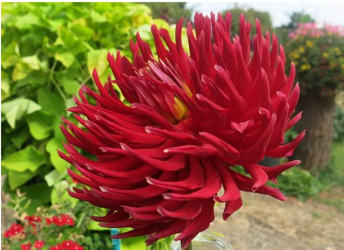
Hollyhill Dr. Rick