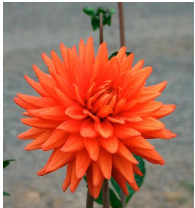
Photo: Hollyhill Tangerine

The 2011 American Dahlia Society National Show, sponsored by the Pacific Southwest Dahlia Conference, will be held the weekend of August 20 and 21 st in Santa Clara California. Many of our members are already planning to attend. If anyone is sitting on the fence, now is the time to commit to a weekend of enjoyment with fellow dahlia enthusiasts. For more information please see http://ads2011.org/events-national-show.html