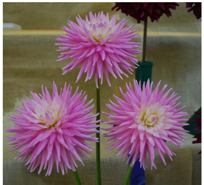
Alloway Candy – Stellar Dahlia