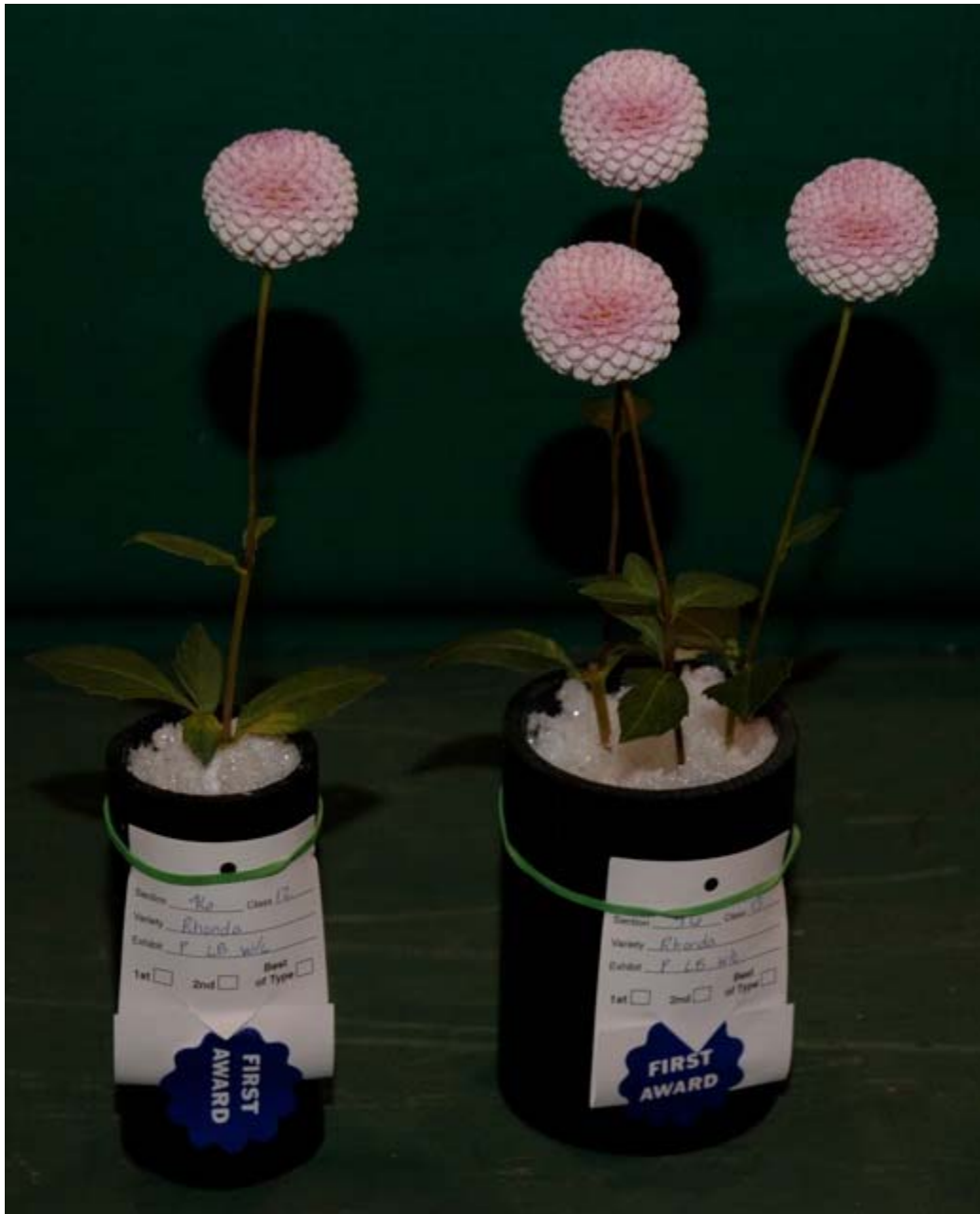
Max Ollieu's entries of Rhonda at the Douglas County Dahlia Show, August 2009

My dahlia year gets active in mid-April with tubers coming out of storage. They were divided and placed in vermiculite five months earlier to rest through the dormant winter season. Instead of planting tubers directly into the garden, I start them in one-gallon plastic containers filled with a 3 in 1 mix of sand, loam and bark dust. Generally there are two tubers per container. Temporary tables outside are used to keep the new sprouts elevated and away from voracious slugs and snails. The best are transplanted into the garden from mid-May into June. Last year, I had over 400 containers. Good friend, Bob Merrell, also a member of the Portland Dahlia Society (PDS), provided me with cuttings as well. The garden holds over 700 dahlia plants, and last year included over 80 varieties. Those varieties and plants provided sufficient blooms for me to compete in all horticultural sections of our dahlia shows.