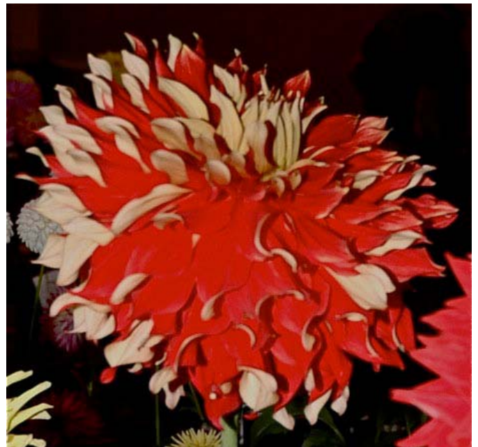
Giant Informal Decorative Nick Sr.