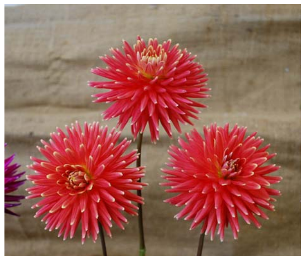
Orchid Dahlia Christie Starlet