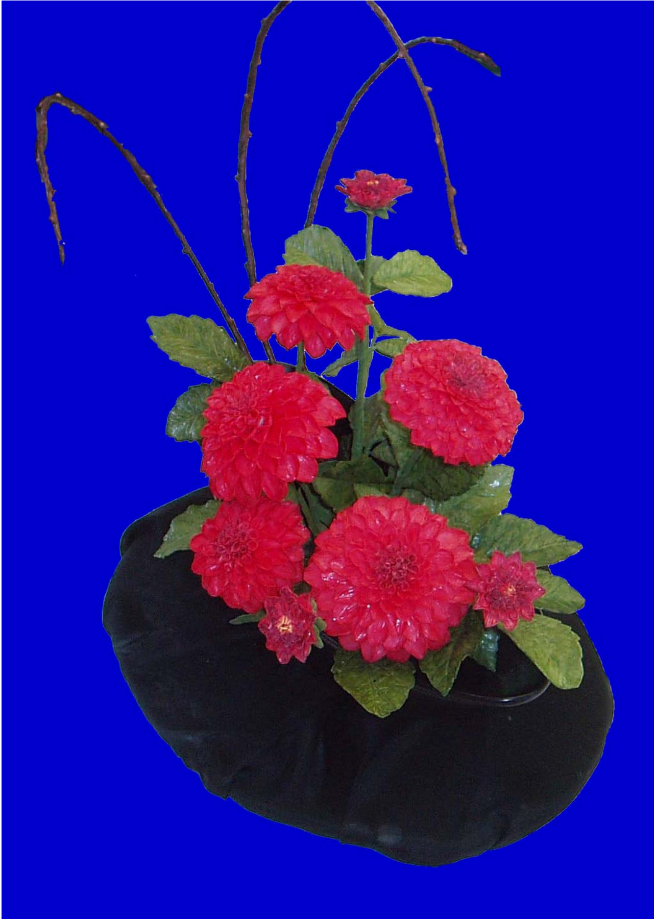
Miniature Decorative 'Glucose Delight'